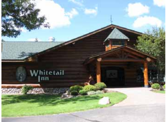
Eagle River, Wi Banquet Venue