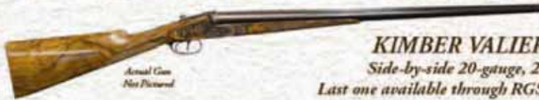
Actual Gun Not Pictured