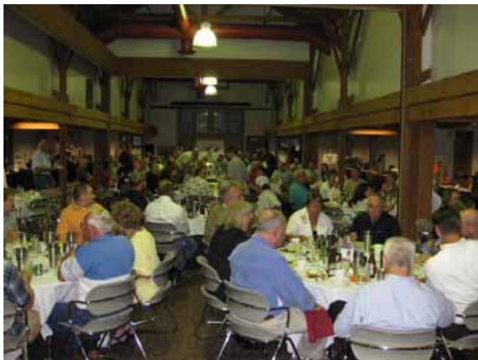
Twin Cities Chapter Banquet

My youngest setter pointed a bear for me the following week, and I'm not sure who was more shocked, the bear or me. No one was hurt during the incident and we all went our separate ways, promising more space to each other in the future. A check on the den a week later revealed the bruin had relocated to a less trafficked area.