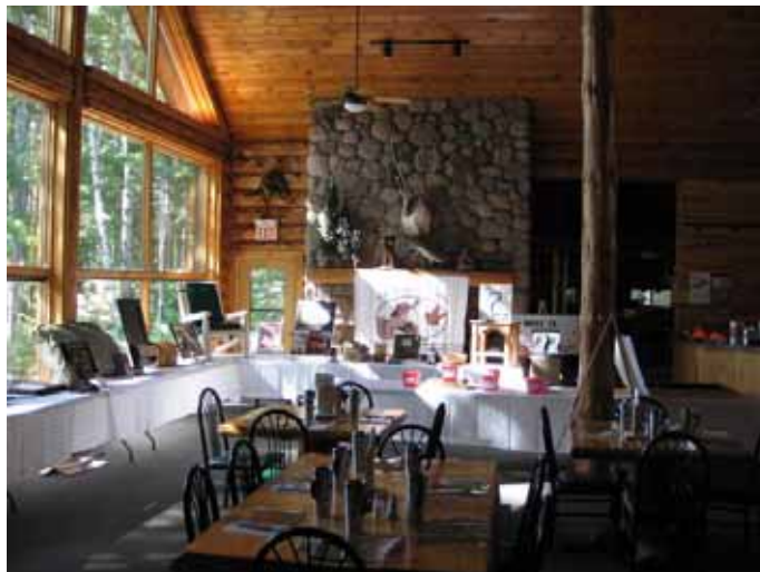
The Aberdeen Lodge, Northern, Wi

The 2010 Fall event season began for me in the tiny northern Wisconsin town of Winchester. The driving force behind this new chapter was a collection of fellows with diverse backgrounds and a common interest in grouse hunting. We began the process the previous year over dinner and followed that up with a public information forum in May of this year to help gauge interest. The banquet date was set for August 14. A gorgeous facility was located and the die was cast. Seventy-four people attended the inaugural event and were feted to a wonderful dinner and some lively games and an auction.